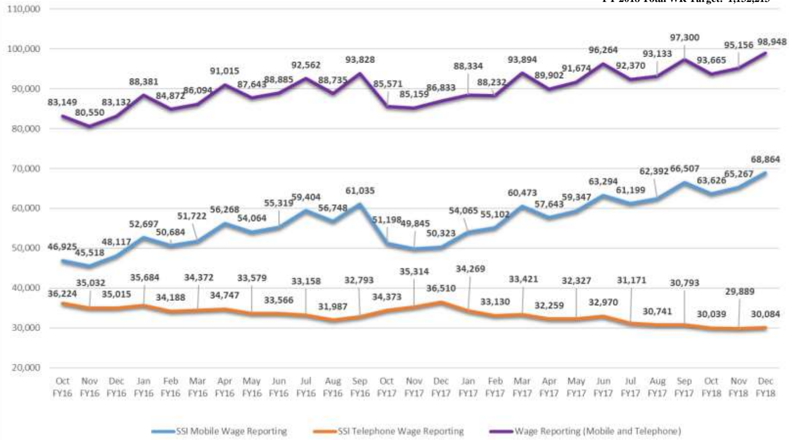
Secondary Indicator - SSI Wage Reporting