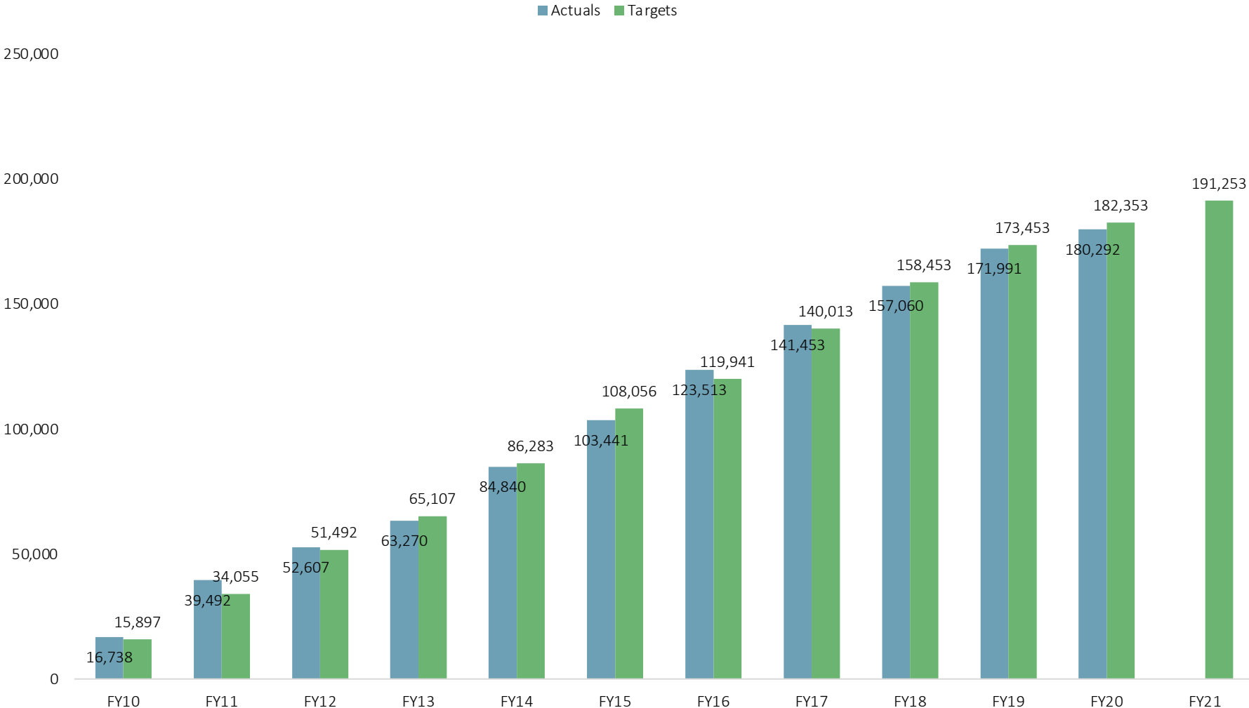
Units Made Healthy, Physically Safe, and Lead-Safe with HUD Dollars, FY 2010-21 (cumulative)