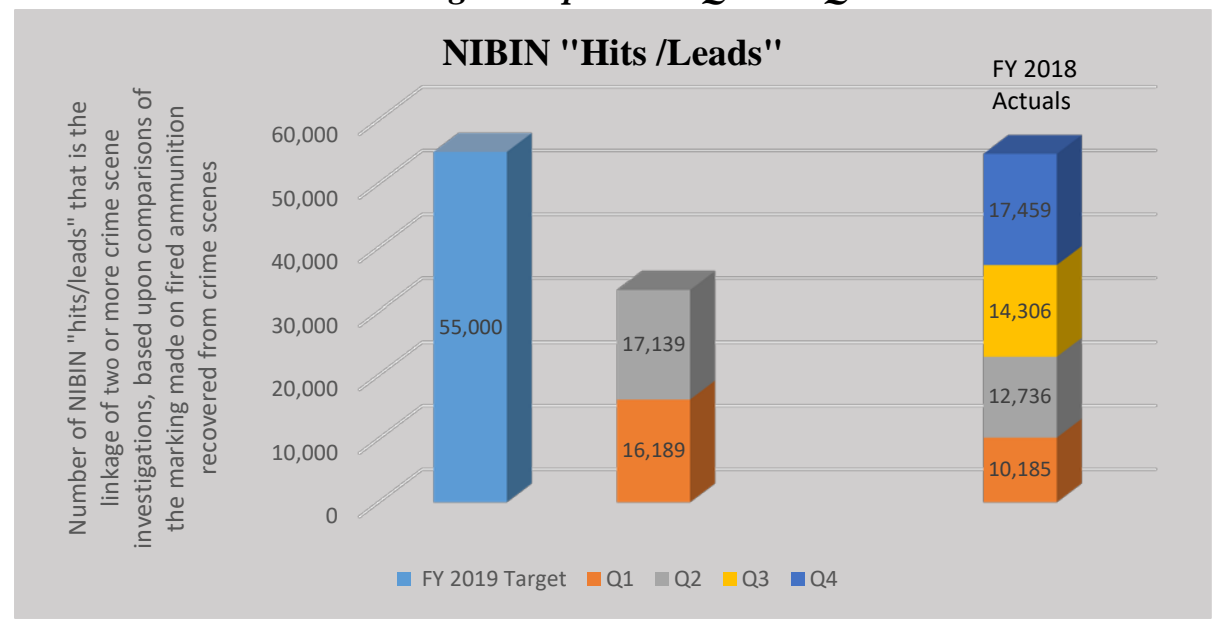
Progress Updates – Q1 and Q2